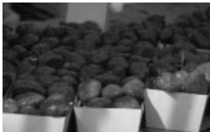
Support farmers by purchasing locally grown produce

If you value the rural character of the surrounding lands and want to help protect them, here are a few ideas: Support our local farmers. Buy locally grown produce and food items (check future updates to our website for local farming businesses). Give farmers and their equipment room on the roads. Recognize that farming practices may generate odors and "rural" smells are part of the landscape. Buy from local agriculture support businesses such as grain/feed stores and farm equipment businesses. Respect the integrity of our rural area by keeping country roads clean and protecting fresh water supplies. Get to know your County officials and voice your concern for farmland loss and your support of preservation efforts. These are just a few things we all can do to help protect the agricultural heritage of the region.