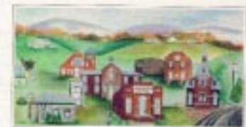
The Adamstown Region Frederick, Maryland